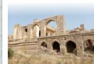
Nandyal, Andhra Pradesh 26th August 2023