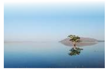
Narsampet, Telangana 7 th August 2023