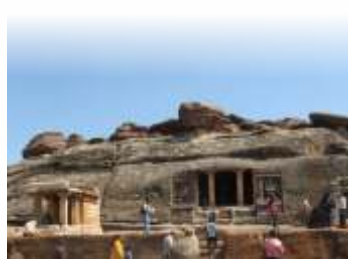
Lingasugur, Karnataka 8th September 2023