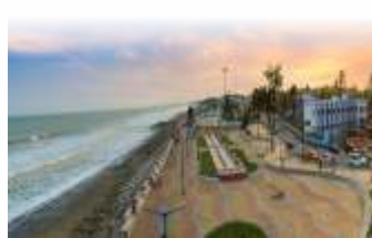
Egra, West Bengal 16th September 2023