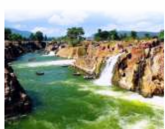
Pennagaram, Tamil Nadu 13th September 2023