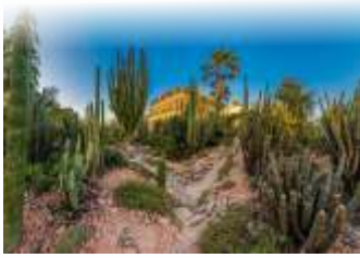
Ratlam Branch 1 st August 2023