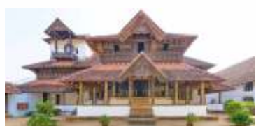
Thuckalay, Tamil Nadu 21st September 2023