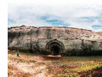
Jehanabad, Bihar 24 th August 2023