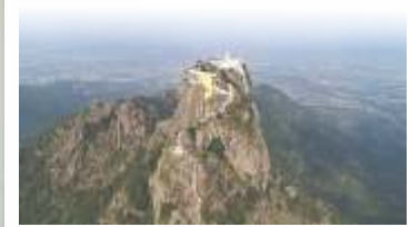
Polur, Tamil Nadu 21 st August 2023