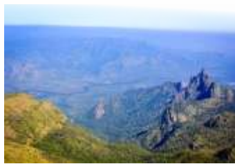
Kotagiri, Tamil Nadu 13th September 2023