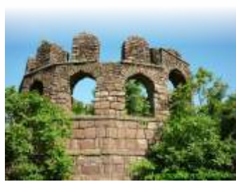
Jagtial, Telangana 11th September 2023