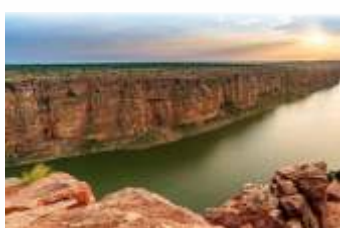
Badvel, Andhra Pradesh 26 th August 2023