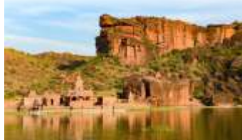
Mudhol, Karnataka 22nd September 2023