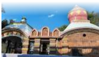
Debagram, West Bengal 19th September 2023