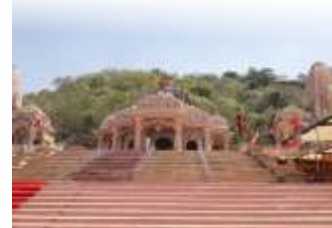
Rajnandgaon, Chhattisgarh 30 th August 2023