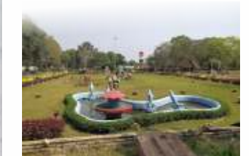
Durg, Chhattisgarh 30 th August 2023