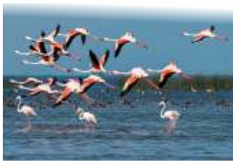
Begusarai, Bihar 7 th August 2023