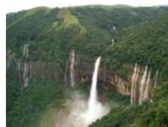
Rajampet, Andhra Pradesh 26 th August 2023