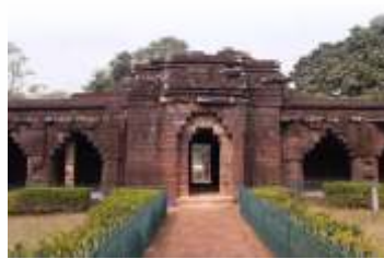
Belda, West Bengal 3 rd August 2023