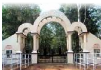
Bilaspur, Chhattisgarh 22nd September 2023