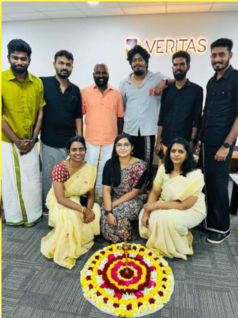
Legal Team, HO