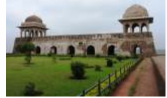
Ashta, Madhya Pradesh 2 nd September 2023