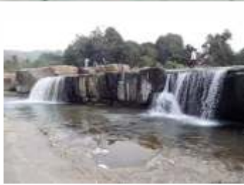
Palakonda, Andhra Pradesh 7th September 2023