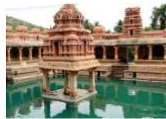
Dhone, Andhra Pradesh 21 st August 2023