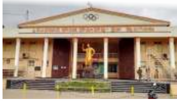
Gudivada, Andhra Pradesh 31st August 2023