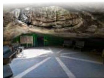
Yemmiganur, Andhra Pradesh 21 st August 2023