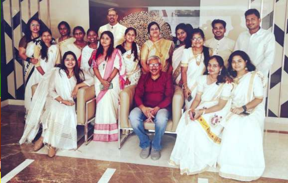
CRM Team, HO