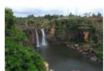
Gokak, Karnataka 22nd September 2023