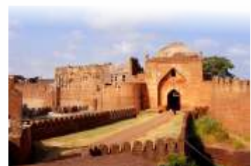
Patna, Bihar 14th September 2023