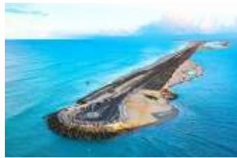
Ramanathapuram, Tamil Nadu 18 th August 2023