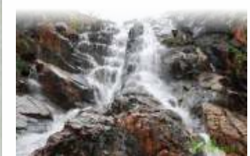
Kadiri, Andhra Pradesh 21 st August 2023