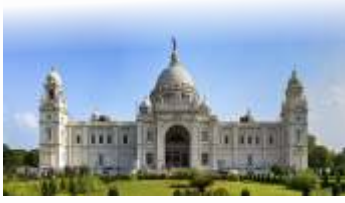
Kalyani, West Bengal 30th August 2023